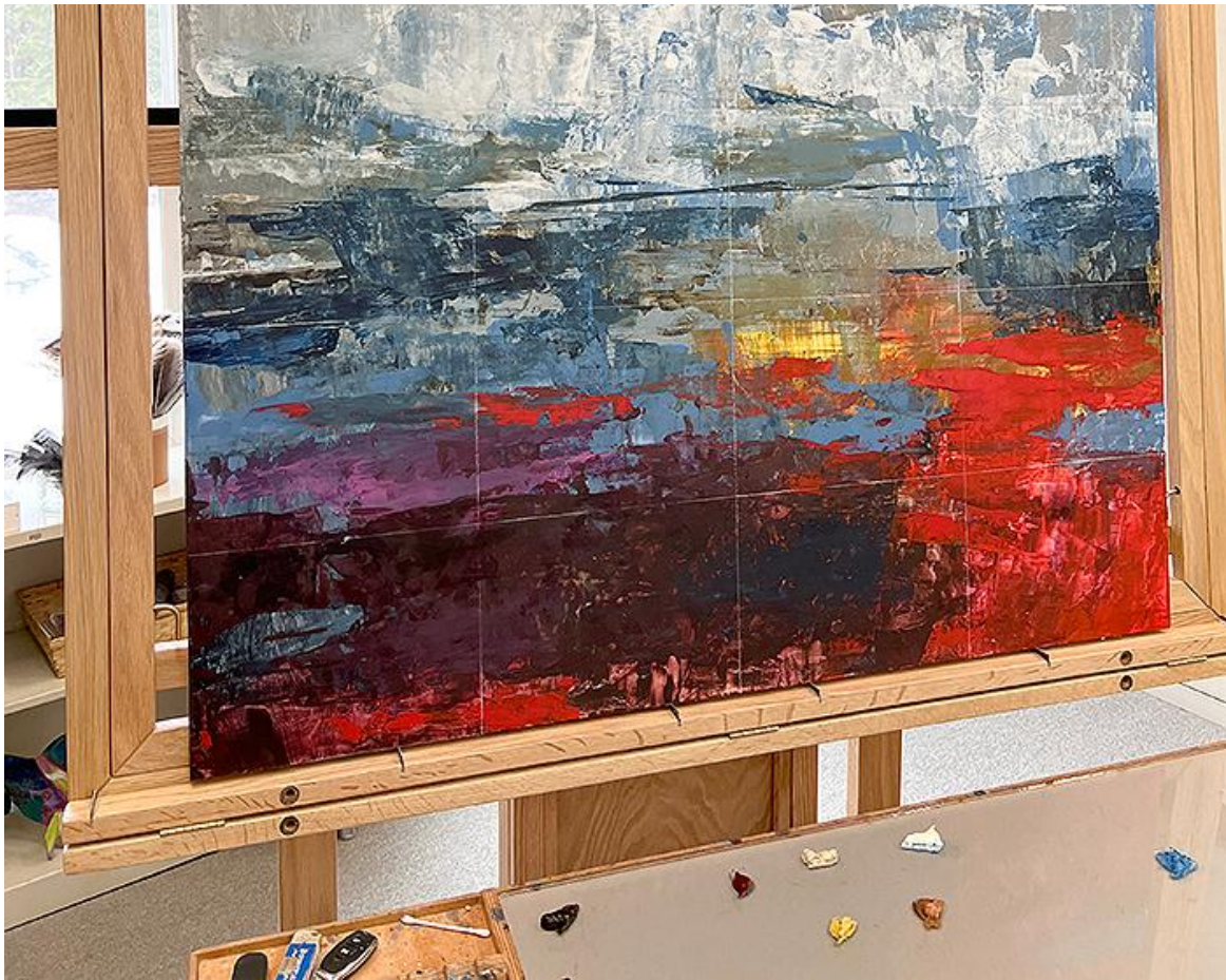
My new Hughes 4000 dwarfing a 30x40 panel with abstract underpainting...

P.S. for the three or four of you who are curious about how we did at Nationals: about as well as I could have hoped. I've never been in an atmosphere like that before — multiple rings, noise, chaos, hordes of people and dogs, long walks from crating to ringside, stadiums of spectators, TV cameras. Our very first run, I needed to scrape Panzer (my dog) off the ceiling and he blew his contacts most egregiously. I had to babysit them the rest of the weekend. (The venue was huge, so I rented a golf cart — and trained Panzer to ride in it.)